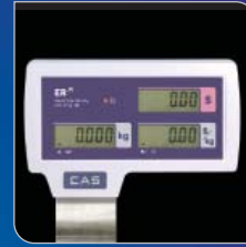
Client view pole display