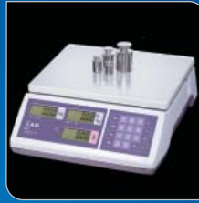
Dual interval technology