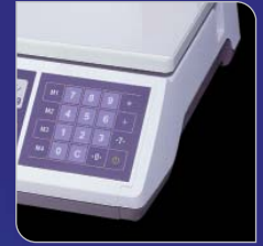
Membrane key pad