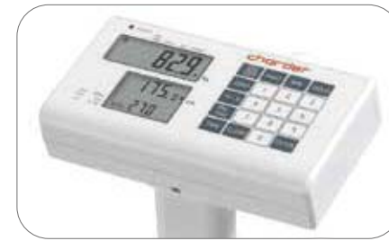
Displays Weight, Height, and BMI on dual LCD dscreens